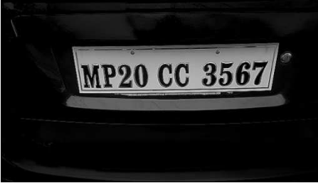
Fig 3 Sharpened license plate image

Where g(x, y) is the image formed after laplacian. The sharpened image is shown below in Fig 3 followed by the binary conversion.