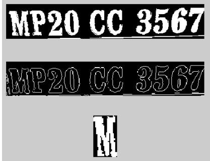
(a) Recognised characters of license plates